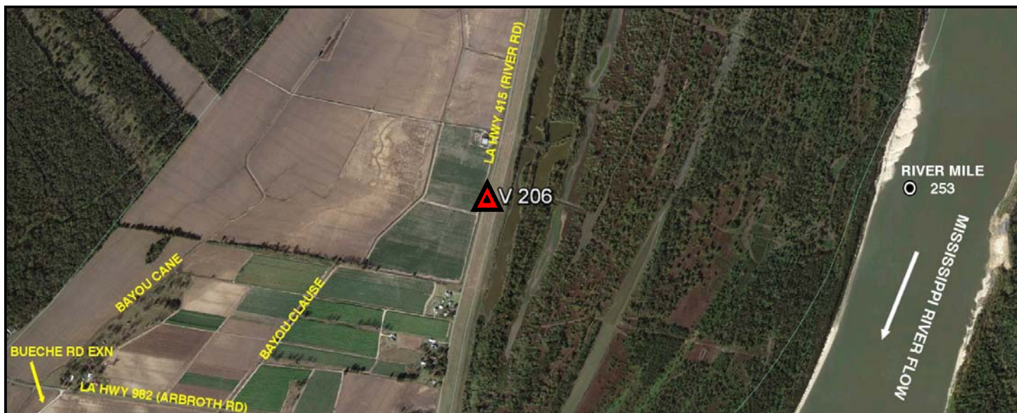
VICINITY MAP Scale: 1" = 2000'