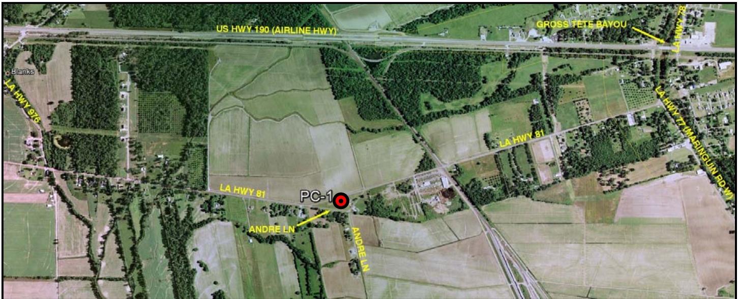
VICINITY MAP Scale: 1" = 2000'