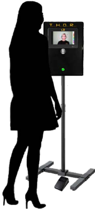
Subject stands 2 feet away from station