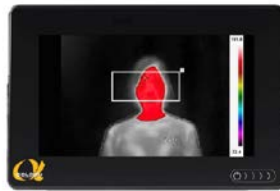
Thermal Spectrum what the camera sees

Infrared thermography provides a visual map of skin temperatures in real time. The subject will see themselves in the monitor (not a thermal image) while their temperature is being detected.