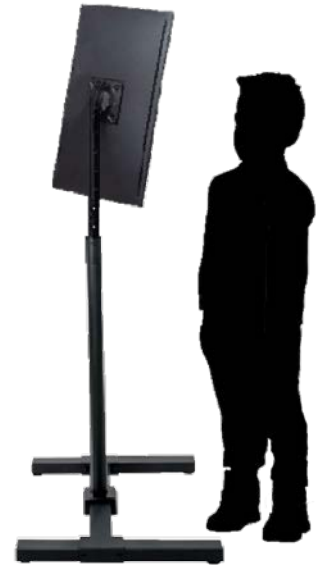
Anti-Tip Design. Adjustable feet pads that level the station on uneven floor.

The station stand is adjustable in order to capture people of varying heights. Other mount options are available upon request.