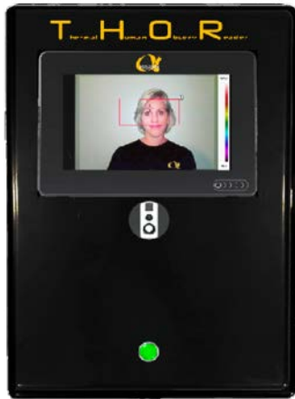
Visual Spectrum what you see