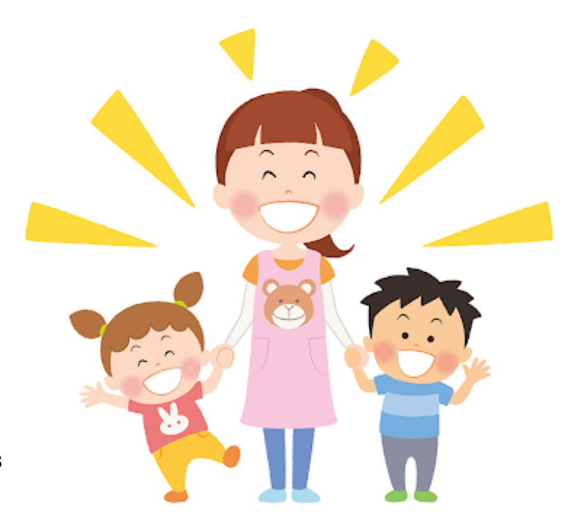
Register HERE .

Red Cross Certification in First Aid, CPR, Water Safety, Choking, and AED mechanics Red Cross Certification in Babysitting, Safety, and Child Development