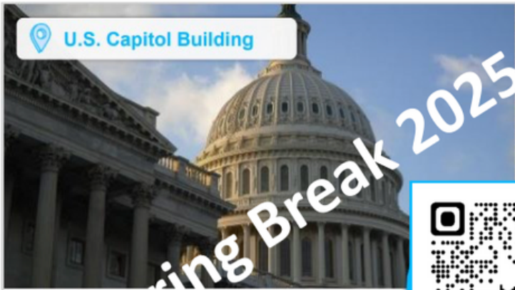
U.S. Capitol Building