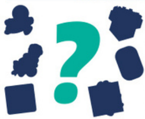
Mystery Dude Perfect Collectible