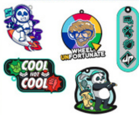
Dude Perfect Collectible 5 Pack