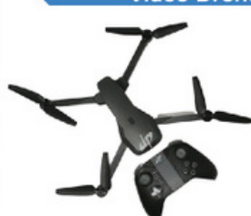
Dude Perfect Video Drone