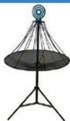
Frisbee Golf Set