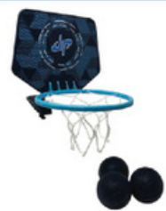
Trick Shot Hoop Set