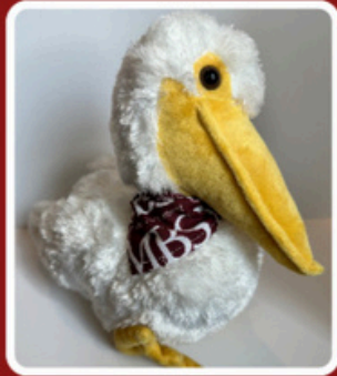
LOUIE THE PELICAN