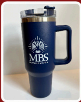
TUMBLER 30 OZ