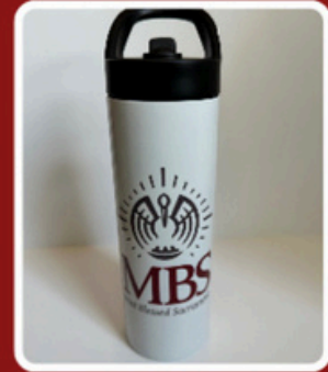
TUMBLER 20 OZ