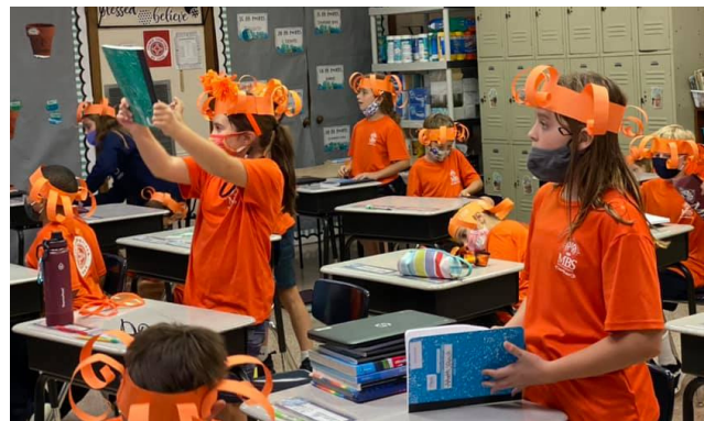
Fourth Graders were getting ready for their balloon game too!

Teachers had to wear pantyhose on their heads. One leg of the hose had a tennis ball in it. Teachers had to knock over cups with the ball - WITHOUT HANDS!