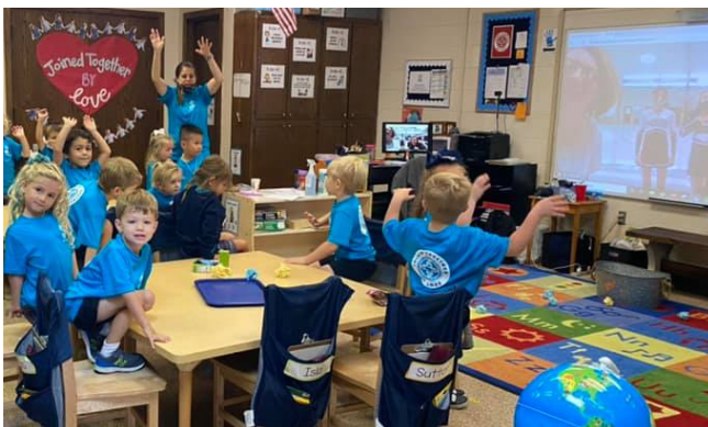
PreKinders tried their basketball talent at throwing a wadded up piece of paper in a bucket. What class can score the most points?

Teachers had to wear pantyhose on their heads. One leg of the hose had a tennis ball in it. Teachers had to knock over cups with the ball - WITHOUT HANDS!