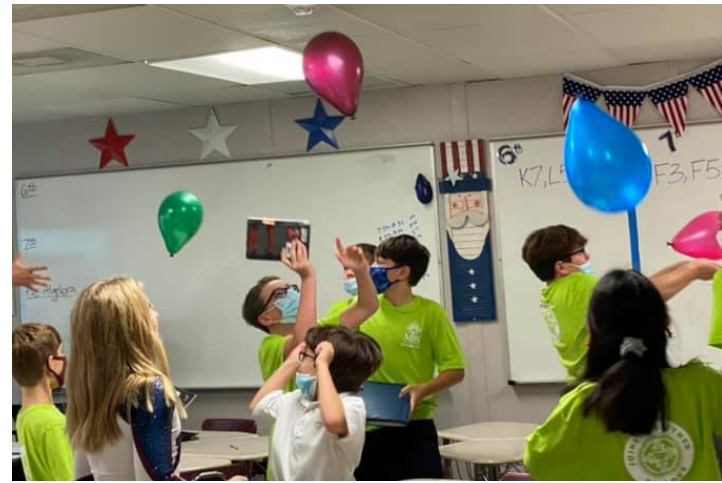
7th graders trying to keep balloons in the air using a folder or a book. If it hits the ground, you lose a point!