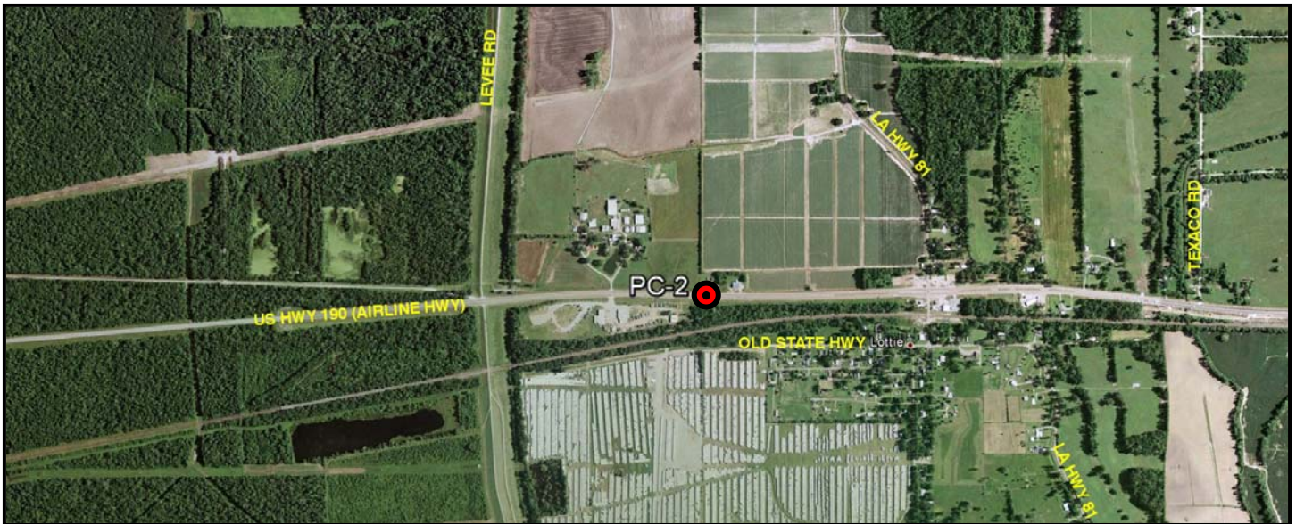
VICINITY MAP Scale: 1" = 2000'