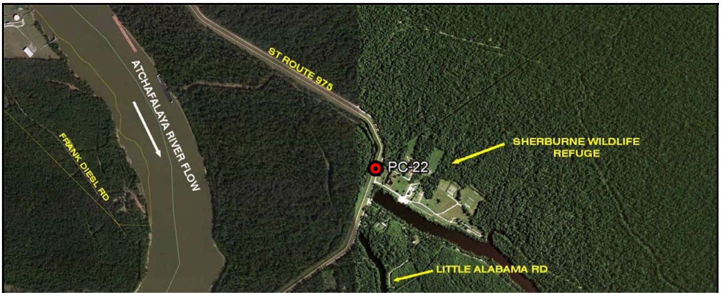
VICINITY MAP Scale: 1" = 2000'