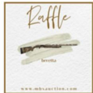
#999 BERETTA SHOTGUN

Enter for your chance to win this classic Beretta 12 gauge shotgun. The A300 Ultima features the classic mechanisms of the reliable A300 platform with new enlarged controls, an improved receiver, and the Beretta Kick Off recoil reduction system. Made in the USA, the A300 Ultima is built tough to withstand adverse conditions out on the hunt and to perform when you need it most. Winner does not need to be present to win. Winner will be announced Saturday, February 4th at the Gala.