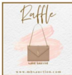
#998 YSL BAG RAFFLE

Enter for your chance to win this gorgeous Yves Saint Laurent large shoulder bag. This classic beauty features a front flap, magnetic snap closure, and is decorated with quilted over stitching. The leather and gold chain strap allows the bag to be worn two ways and the dark beige leather will complement any outfit! A true wardrobe star. Winner does not need to be present to win. Winner will be announced Saturday, February 4th at the Gala.