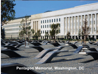
Pentagon Memorial, Washington, DC