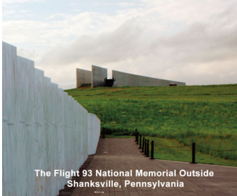
The Flight 93 National Memorial Outside Shanksville, Pennsylvania