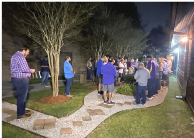
The men of That Man Is You at Most Blessed Sacrament gathered outdoors on Friday, October 6th, for the TMIY Rosary in the Rosary Garden at 5:30 a.m. rather than indoors because of cooler temps!