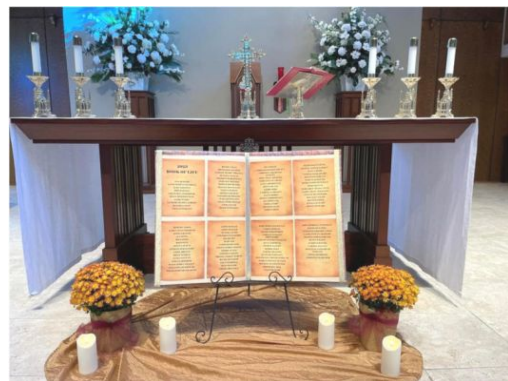
Book of Life