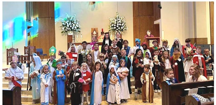
MBS School Children dressed as Saints

We will walk around the church parking lot. Please pay attention to the weather and dress accordingly. A reception will follow in the new Parish Activity Center.