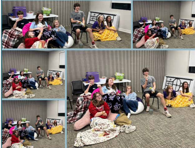
ABIDE Chosen Watch Night Fun!