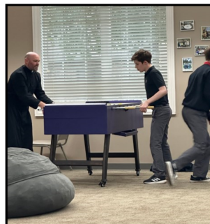
ABIDE After School