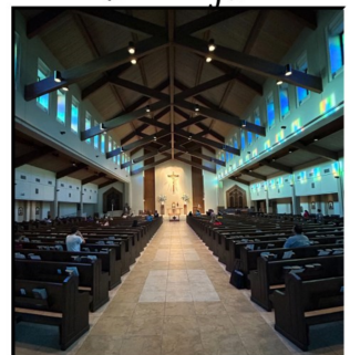
Pizza & Praise Night