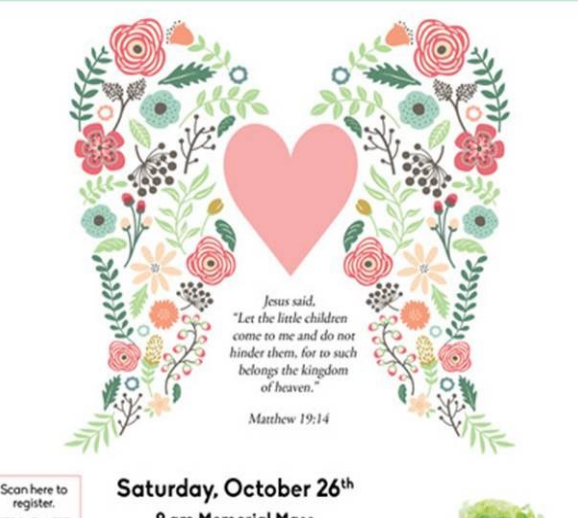
for Children Lost During Pregnancy