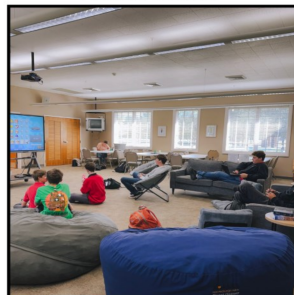
ABIDE After School